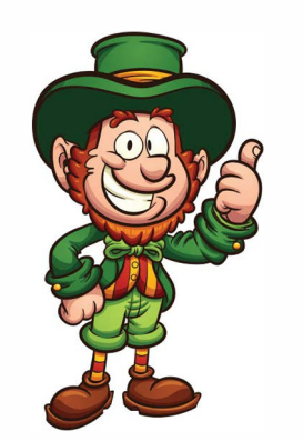
March Guess how many

Join in on the fun with LUSO school banking contests and a chance to win some great Prizes.