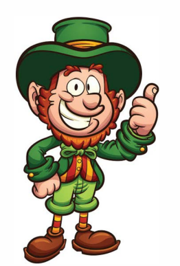
March Guess how many GREEN

Join in on the fun with LUSO school banking contests and a chance to win some great Prizes.